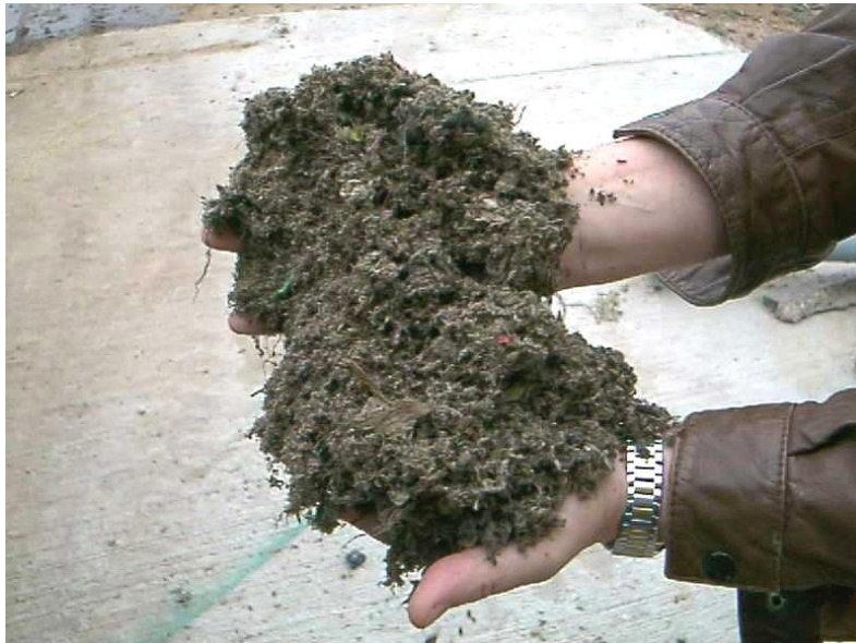
Figure D-1. Fluff® is a colorless, odorless, aggregate cellulose pulp.

cellulose pulp, which is then dried and the resulting organic material (Fluff) is separated from the recyclable glass, metal, and plastic constituents by air classification. The organic byproduct from this process can be landfilled at a 30%-75% (depending upon the input materials) reduction in volume (BouldinCorp, unpublished data 2001). This technology is currently being used in Warren County, Tennessee, where a 95% recycling rate has been achieved for the county's MSW, with the bulk of the organic byproduct composted for use as a topsoil replacement in the horticultural industry (Croxtton et al. 2004).