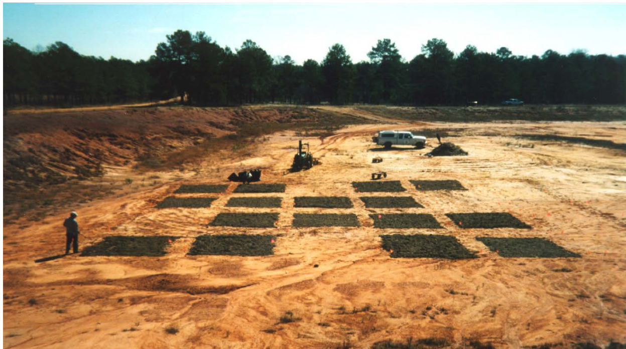
E-1. The "before" photo of the Borrow Pit site at Fort Benning, GA (ERDC-CERL 2003).