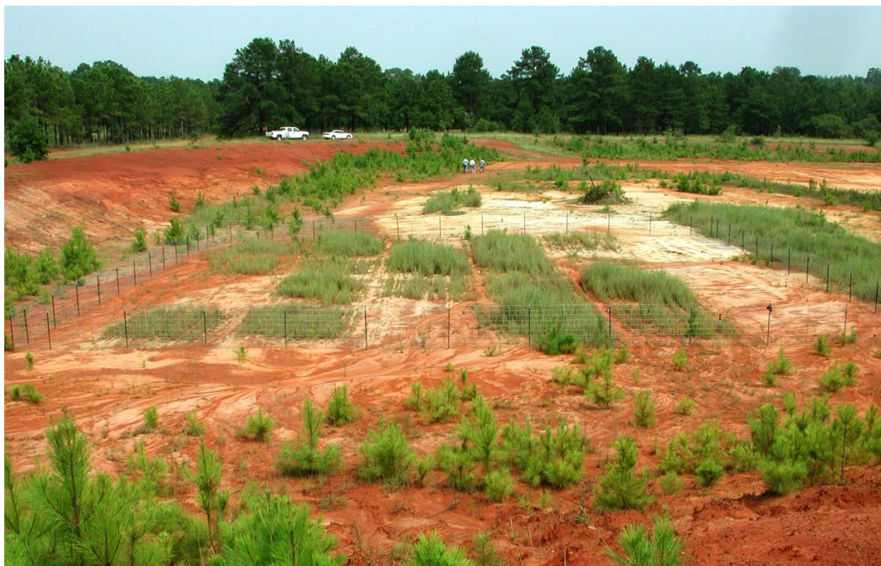
E-2. The "after" photo of the Borrow Pit site at Fort Benning, GA (ERDC-CERL 2005).