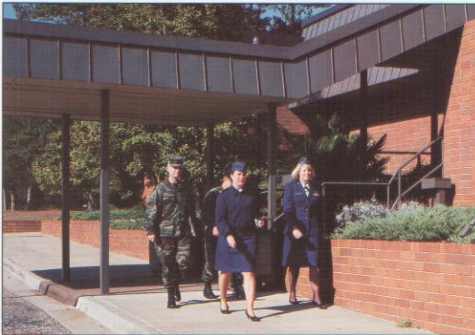
Define entry with canopies or car-port type patron drop-off areas.