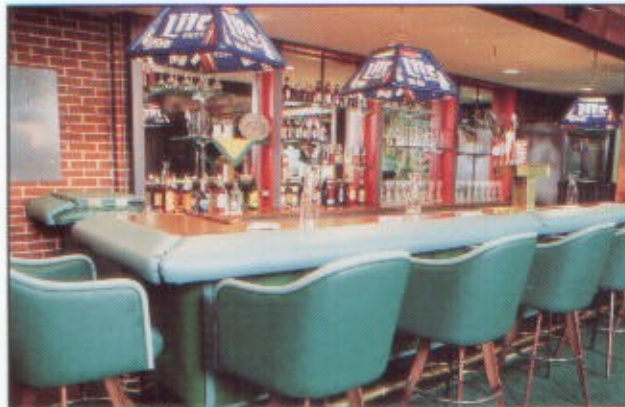
Choose durable counter tops with pull-up space for bar stools.