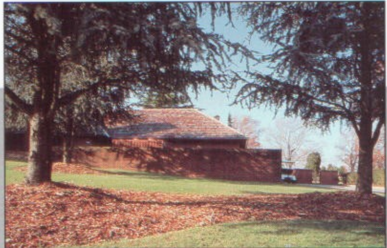
Provide landscaping that is attractive, of low maintenance, and well maintained.