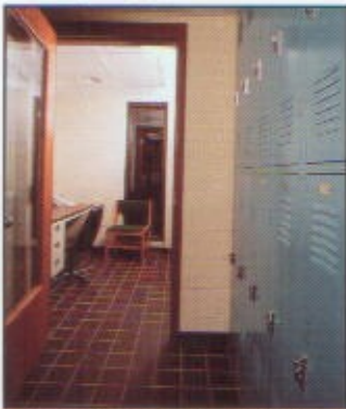
Furnish employees with a storage/locker area.