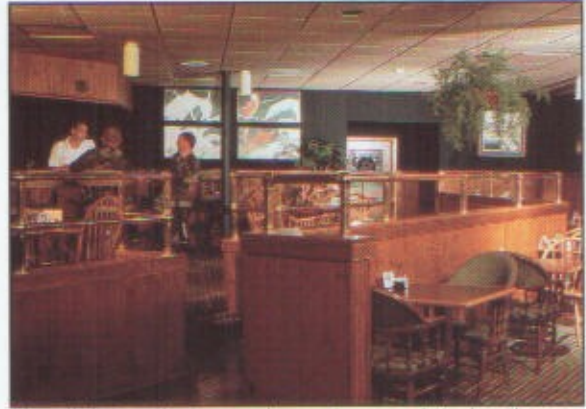
Use lighting that complements your interior theme.