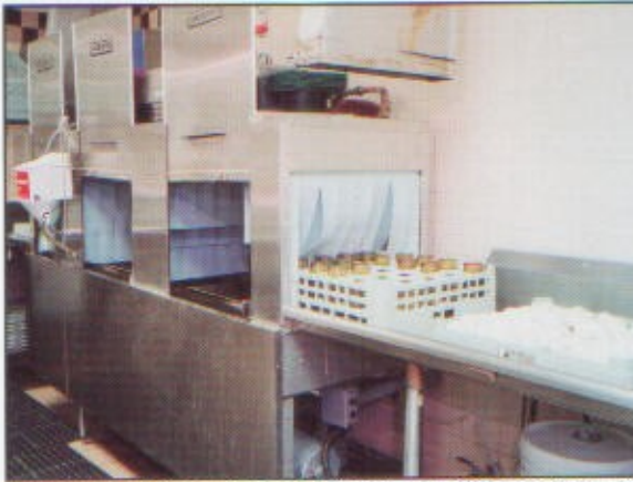
Locate washing and sanitation facilities close to preparation and service areas.