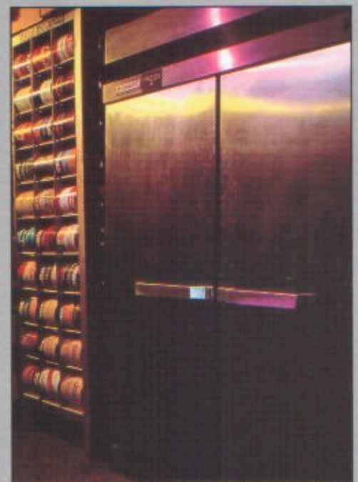
Locate storage areas and freezer units conveniently near delivery entrance.