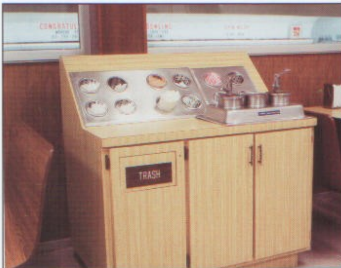
Place multi-purpose units to reduce space requirements and equipment costs.