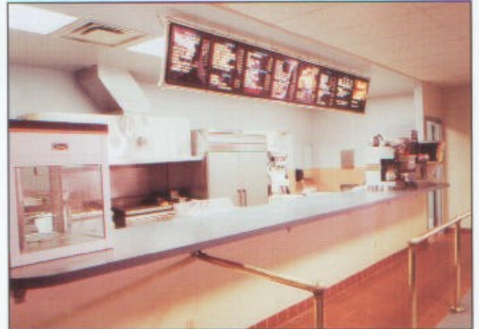
Plan a well-lit and spacious ordering area to accommodate a line of customers.