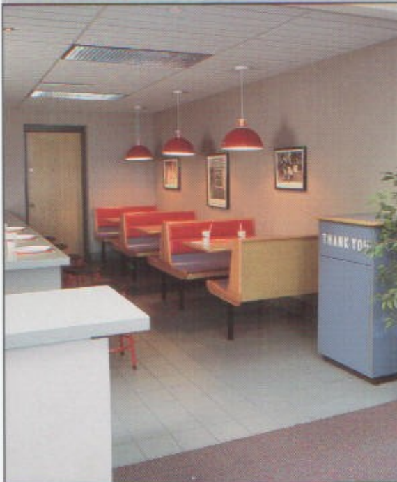
Install fast-food style seating that encourages quick customer turnover.