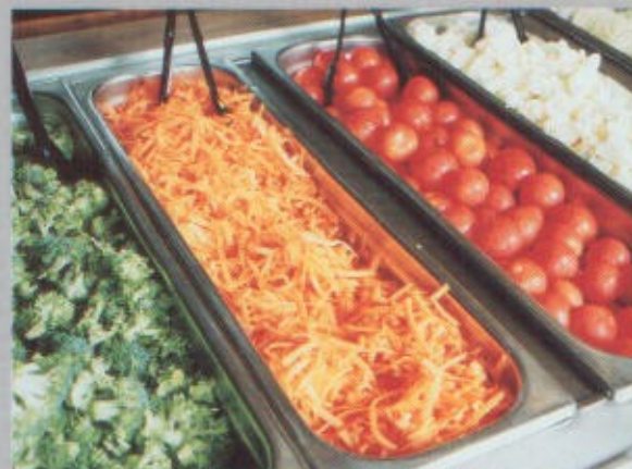
Keep salad and food bars refilled to present an attractive appearance.