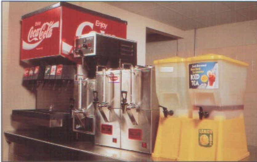
Provide drink refill counters with ice dispensers, popular soda brands, iced tea, and water.