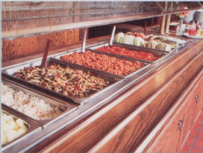
Organize salad and food bar choices in a logical arrangement for patrons.