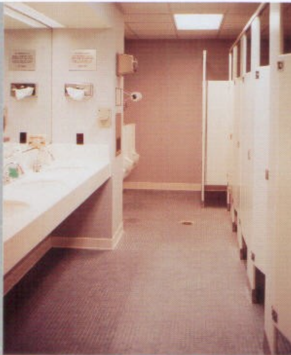
Use water-resistant easily maintained finishes in rest rooms.