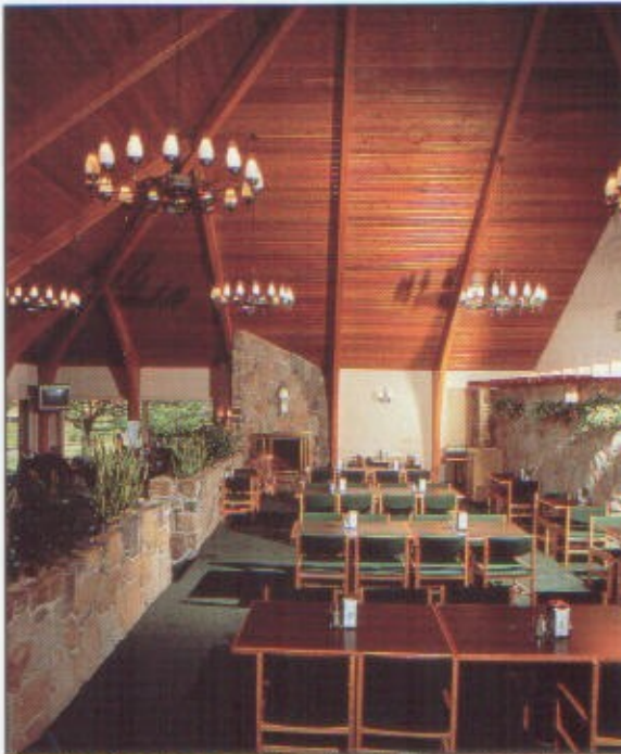
Carpet floor areas for customer and employee comfort