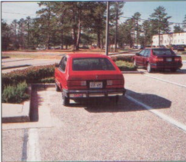
Provide ample parking that will accommodate peak customer flow.