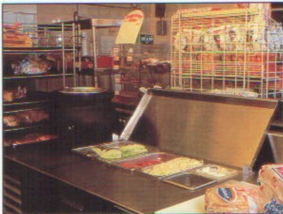
Keep food preparation areas clean and free of clutter.